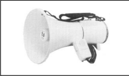
ER-76 & ER-76W