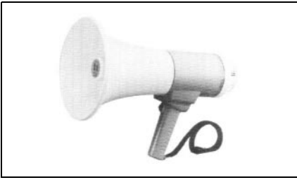
ER-409 & ER-409W